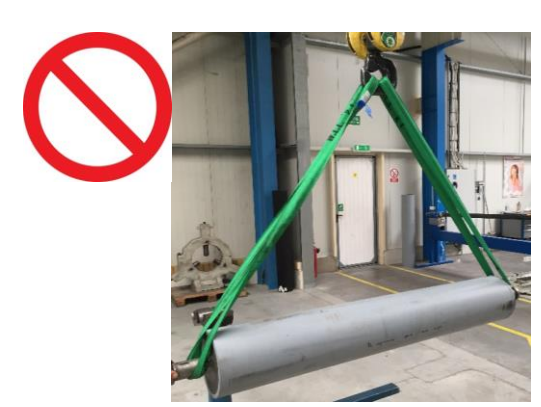
this way you will not install the "roller" on the holder, but you will damage the rubber surface!