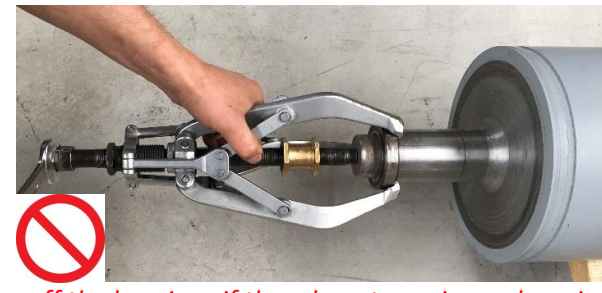
do not take off the bearings if they do not require exchanging!