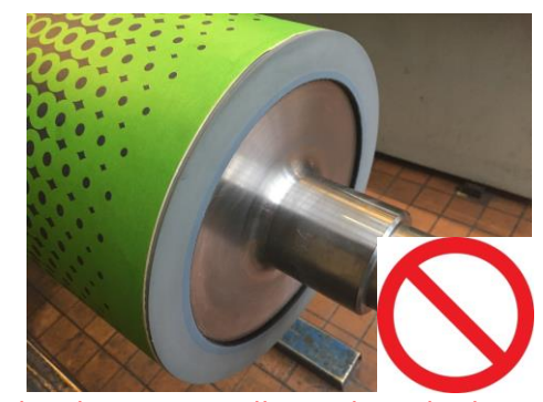
Make sure to put the sleeve centrally on the cylinder

b. Use proper sling to remove the cylinder with the new sleeve from the holder